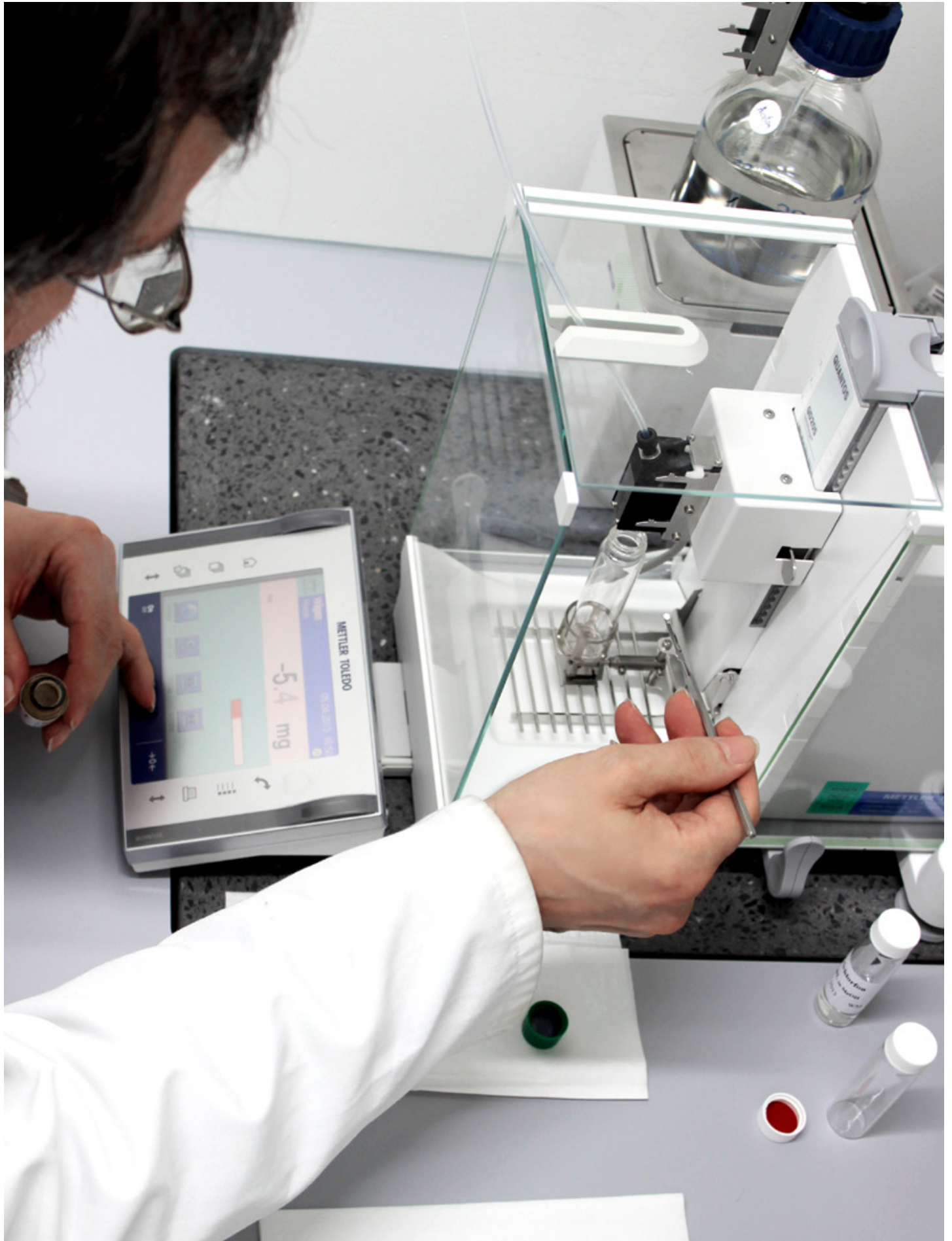
Preparing samples using the Quantos QA system The raw substance for the stock solution is weighed in by hand, then Quantos automatically creates the correct concentration using the liquid module.